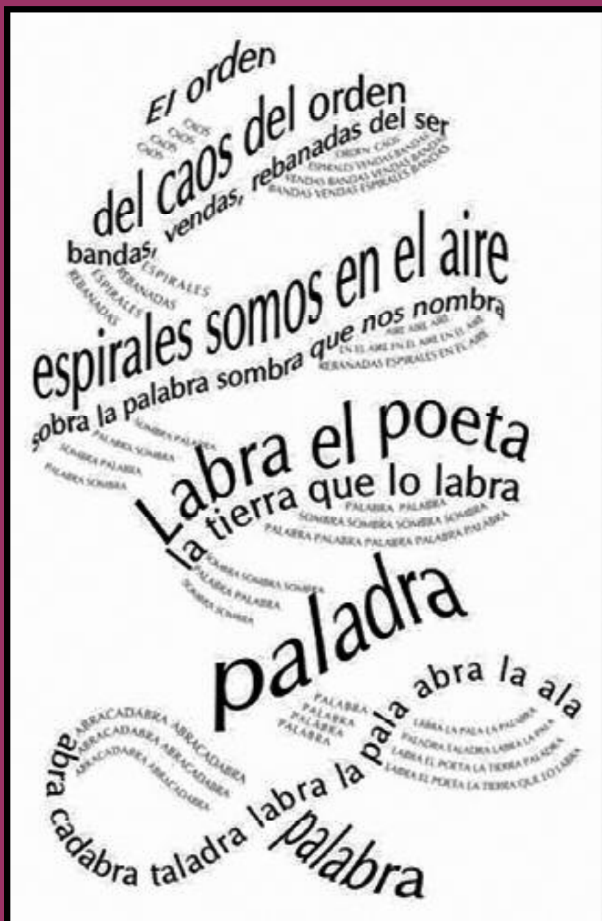
Cáscaras (Alfredo Espinoza)